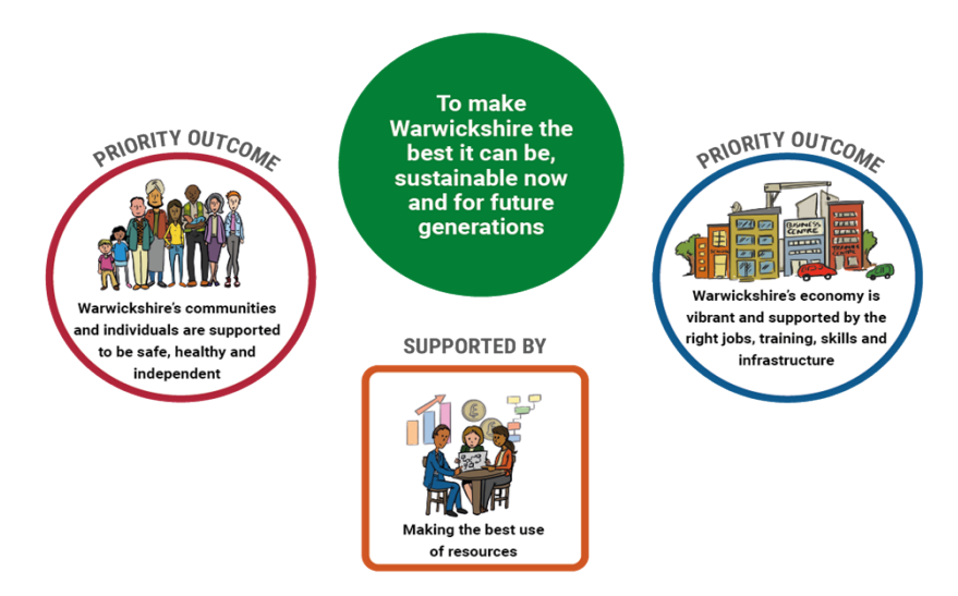
Figure 2: The Council's Core Purpose and Priority Outcomes

The Annual Governance Statement provides assurances that these processes are working in practice and provide services in line with our priorities by delivering on our supporting priority of Making the Best Use of Resources.